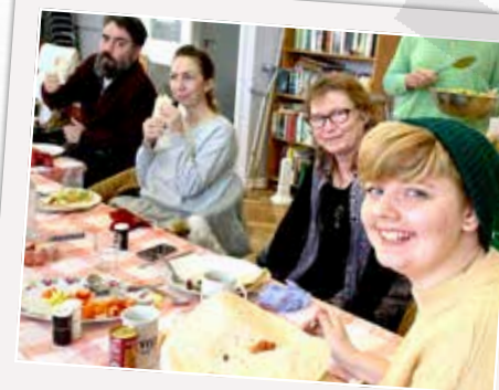
Nurturing community at Genesis Life Projects

With that in mind, we are so very grateful for the support and partnership of so many including churches, businesses, trusts, financial supporters and volunteers. We are always looking at ways we can improve and, as an example, are aiming to make volunteering easier by introducing our new 'Assemble' system, so do please look out for more about this. We know that without you all, Genesis Trust would not be possible.