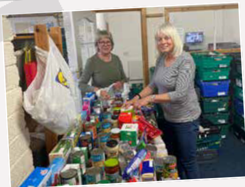
Our volunteers at Foodbank warehouse

Supporters who gave money to provide essential food and resources