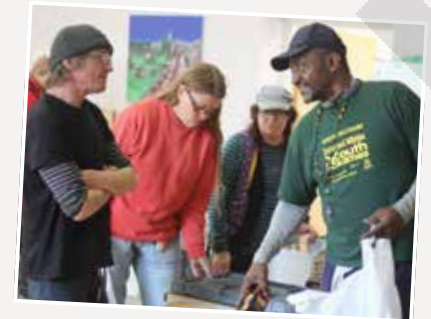
Building relationships at Genesis Life Projects

We have continued with a dedicated one-to-one approach with our clients as the time and space has created meaningful conversations, which in turn have borne wonderful fruit. We have been able to tailor support for each individual and direct them to the right kind of courses, sessions