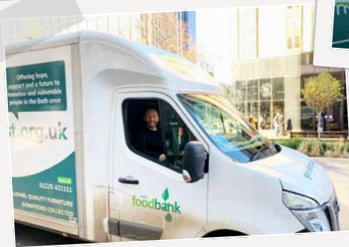
Genesis Furniture staff delivering furniture country-wide