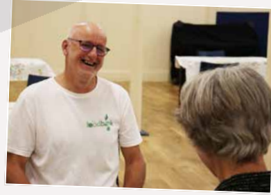
A warm welcome given at our Foodbank centre

A big thank you goes to our community who have donated 57,000kg of food with many others providing financial support. Because of your kindness Bath Foodbank have been able to support 5,243 people, 1,352 of whom are children.