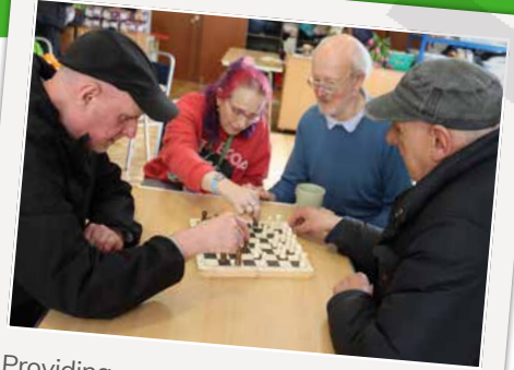
Providing a social space for community to thrive

Helping support this is the recent sale of our West Avenue premises, which currently houses Bath Foodbank's warehouse. At the time of writing we are finalising arrangements for an alternative premises.