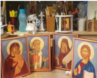
Priceless Imagery – Mounted icons