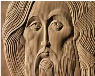
Ewan Craig – Sculpture